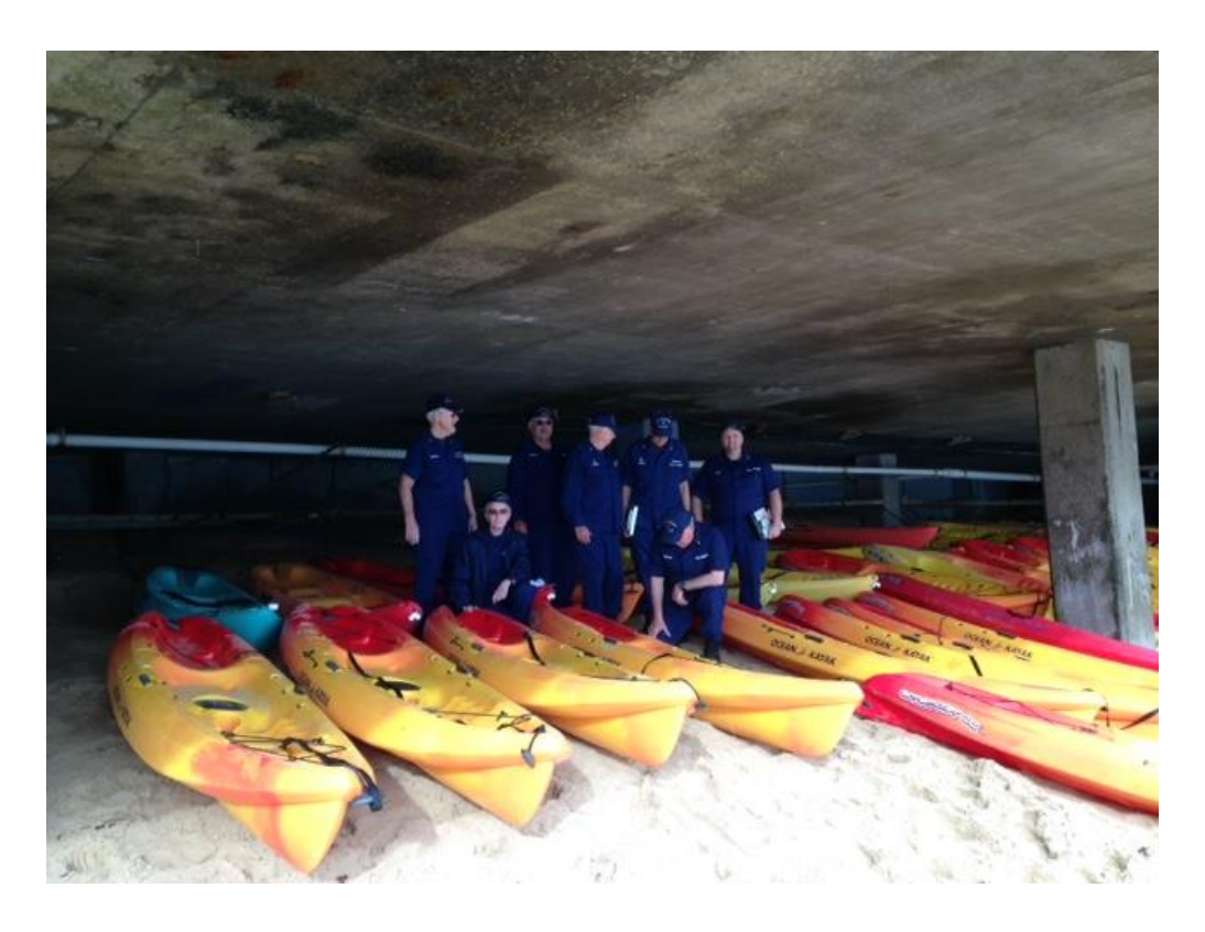
April 4, Eight Monterey Flotilla Vessel Examiners and one trainee conducted Vessel Safety Checks (VSCs) divided up over two rental kayak vendor locations. The one above is quite unique under a major Cannery Row hotel, on an ocean beach with racks housing the kayaks suspended from the bottom side of the hotel floor. After removed from the racks, kayaks are examined on the beach. For safety VSCs are conducted at low tide and when the waves are small.