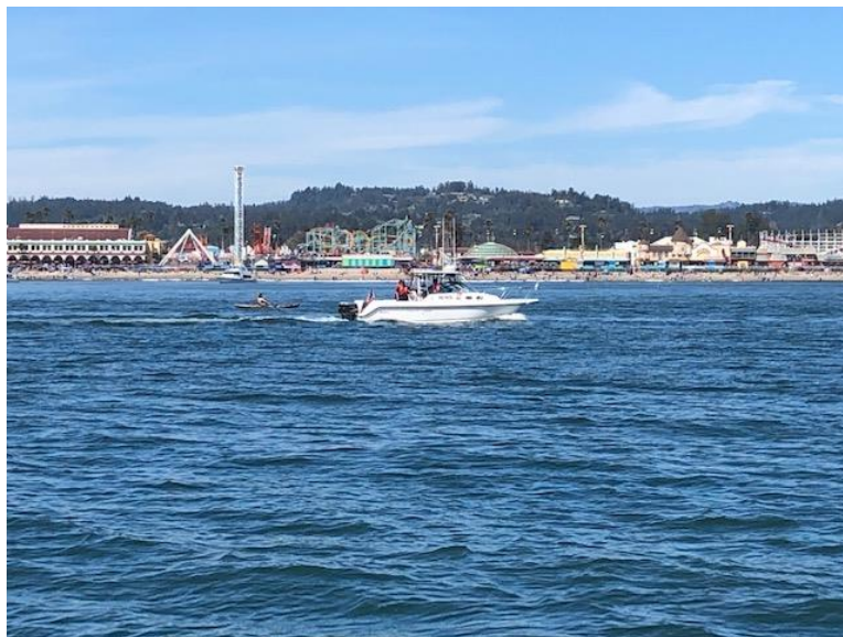
Out on patrol vessels #219 with #522 (not shown) near Santa Cruz Harbor