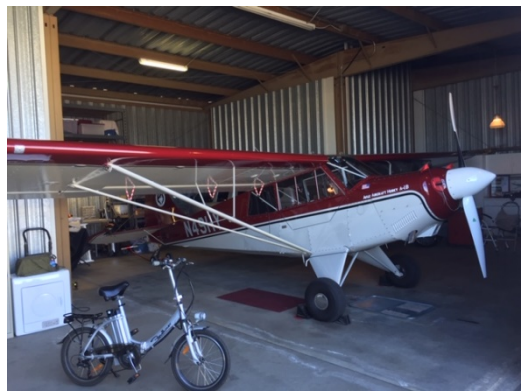
Our TWO Division 6 Fighter Aircraft...uh... Air Facilities! 😊