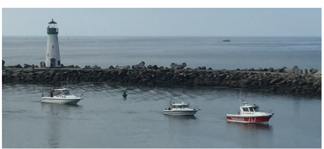
Facility 301219 assisting Vessel Assist