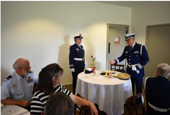
Missing Man Ceremony

Part of our program involved our District Color Guard participating in the “Missing Man Table” ceremony