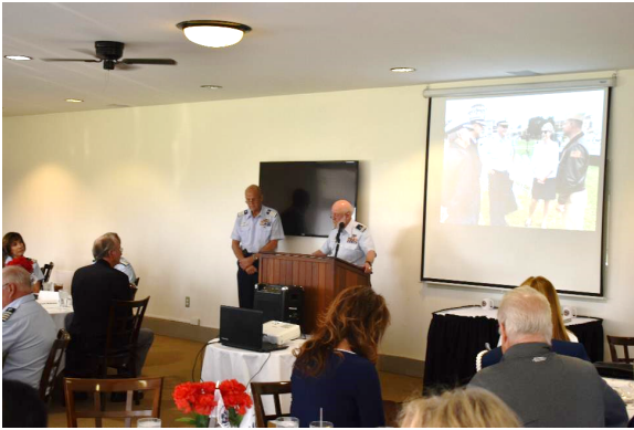
The Invocation