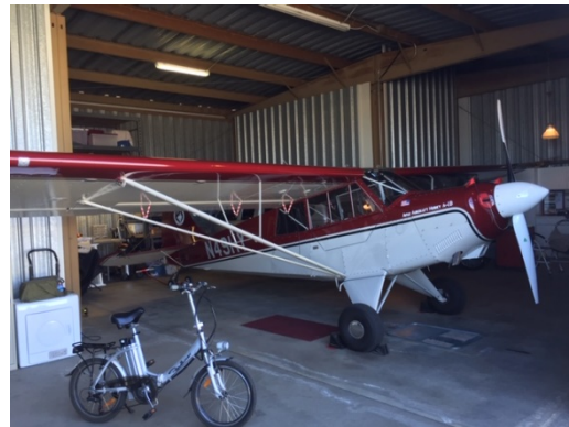
Our TWO Division 6 Fighter Aircraft...uh... Air Facilities! 😊