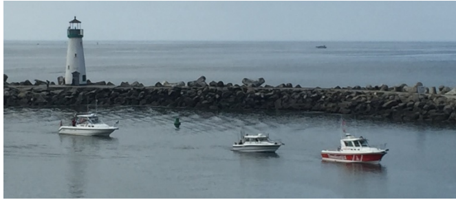
Facility 301219 assisting Vessel Assist