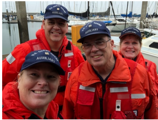
Some of the Crew of Silver Charm for the day