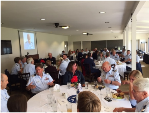
Team Coast Guard Change of Watch!

Part of our program involved our District Color Guard participating in the “Missing Man Table” ceremony