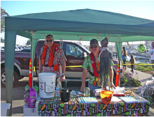
A modernized Public Affairs Booth!