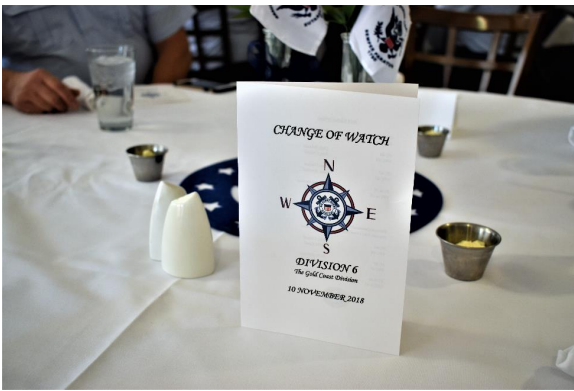
The Change of Watch Program