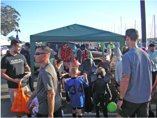
Huge numbers of Visitors