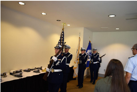
District Color Guard Posting the Colors