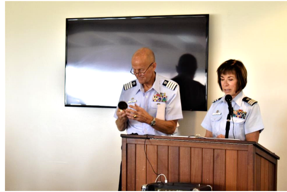
The Old and New Division Commanders!