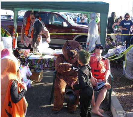
More Fun!