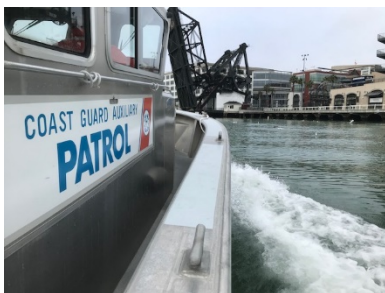
Checking on bridge maintenance in SF.