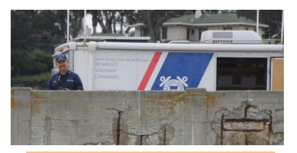
Division 12 SO-CM Bob Torio getting ready to manage radio communication for Fleet Week