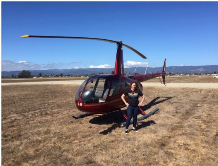
The Helicopter (prospective Facility), and Pilot!