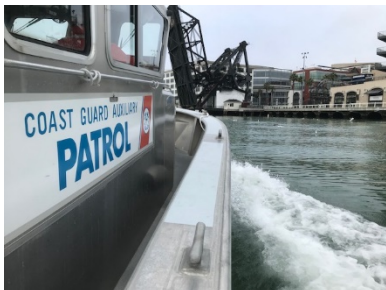
Checking on bridge maintenance in SF.