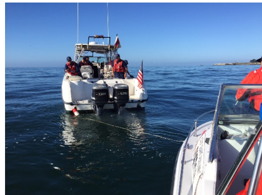
Stern Tow executed flawlessly