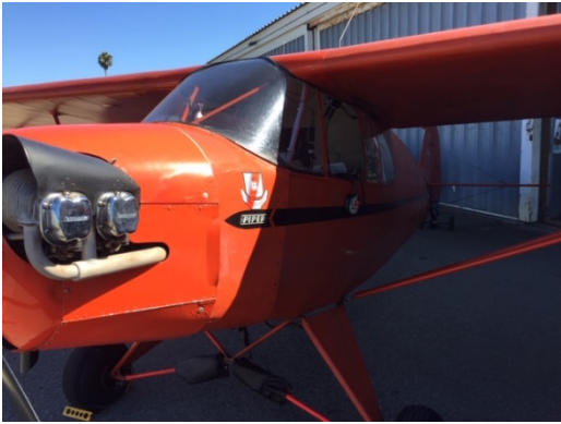
Glenn's Aircraft with its "Facility Decal!"