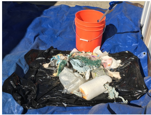
Just some of the Garbage picked up!