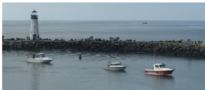
Facility 301219 assisting Vessel Assist