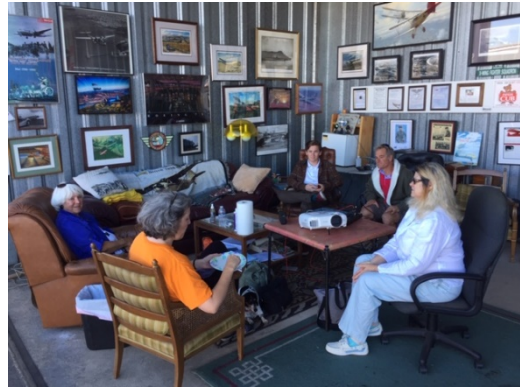
Relaxing in Glenn's Aircraft Hanger prior to the meeting/ barbecue