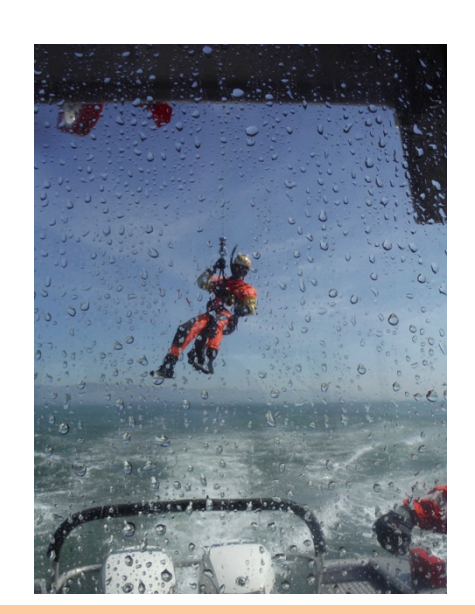
Rescue Swimmer coming down on the deck