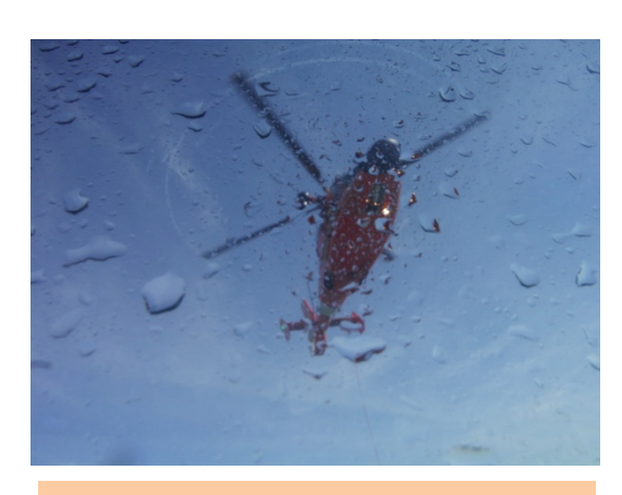
View of helicopter directly overhead