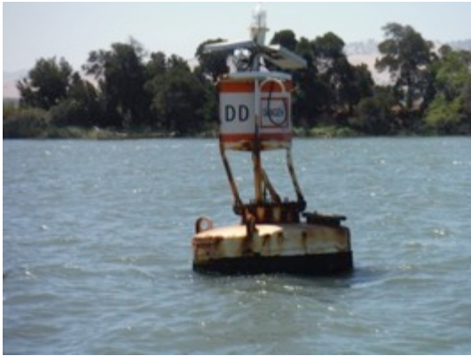
Delta Diablo Outfall Lighted Buoy showing some apparent damage from impact with vessel