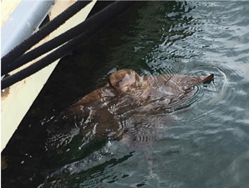
Back at the dock in Marina Bay, we saw a bat ray near the dock.