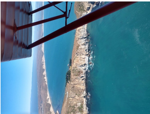
A view from Glen's Aircraft