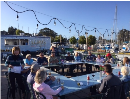
Great Party and even better Fellowship!