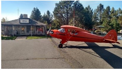
Our Division 6 Fighter Aircraft...uh... Air Facility!