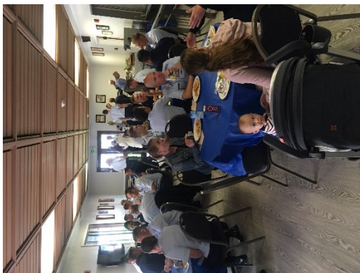
Reception Area Fellowship