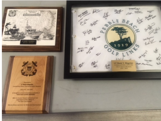
The Auxiliary Plaque next to other presented plaques