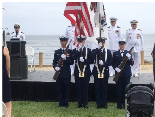
Coast Guard Honor Guard and Official Party