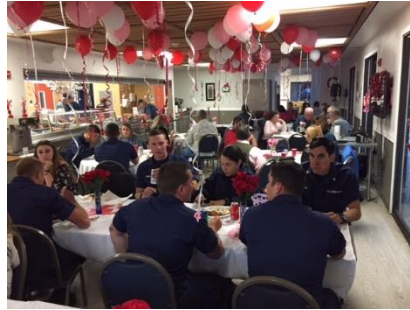
Happy Valentine Diners