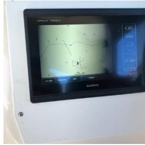
Tammera's search pattern.