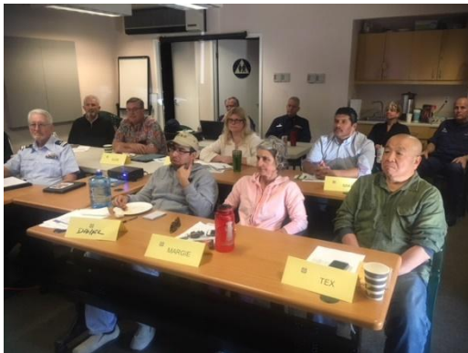
Involved Students!

Feedback from the participants at the completion of the training was OUTSTANDING!