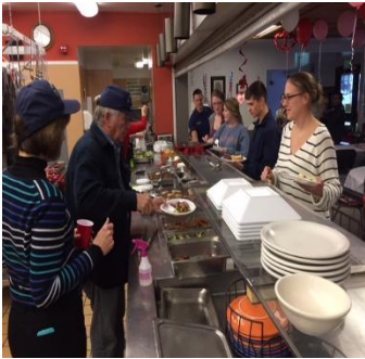
The Chow Line

cream/ crumbled bacon, mixed vegetables, and two different cakes with chocolate and vanilla ice cream.