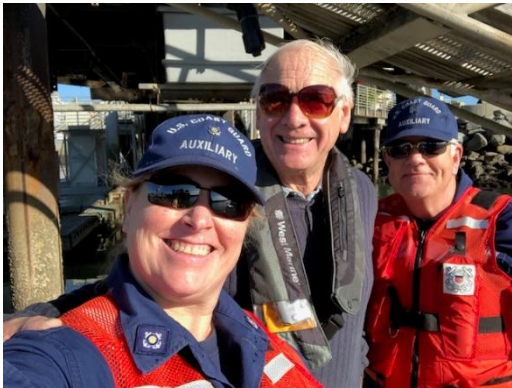
The occupant of the sailboat, happy with our service.

After a full day of training, entering the harbor mouth at Santa Cruz harbor to find a Sailboat in trouble. We were able to pull the sole person aboard the sailboat to our facility and get a line attached to the forward cleat. Harbor Patrol, using our attached line, pulled the boat out of the harbor mouth for securing by Tow US. A great rescue by three allied partners. Semper Gumby