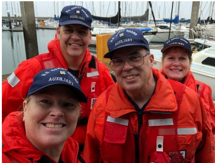
The Crew of Silver Charm for the day.