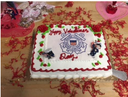
Cake 1- Chocolate