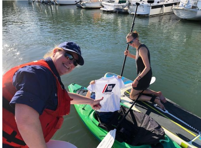
Icing on the cake of a day, Giving a "I Got Caught wearing my Life Jacket" T-shirt to a 8 year old young lady. Great example.