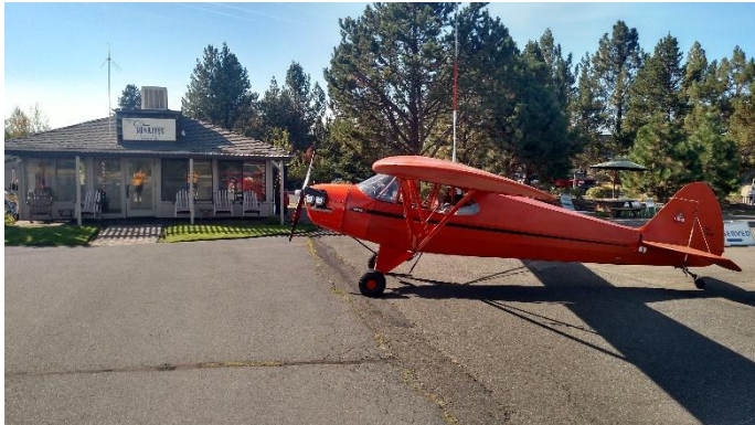
Our New Division 6 Fighter Aircraft...uh... Air Facility! 😊