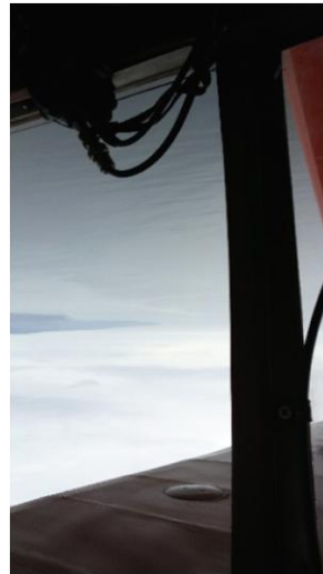
View while airborne!

First photo : Now seated and airborne, Alexander Urciuoli during an AOR Familiarization flight. Selfie photo taken by A. Urciuoli 10 March 2018