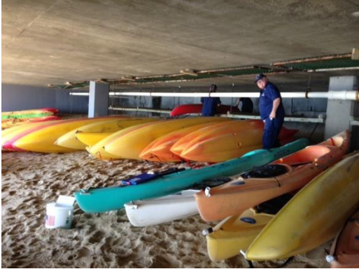
A "Target-Rich" Kayak Environment!