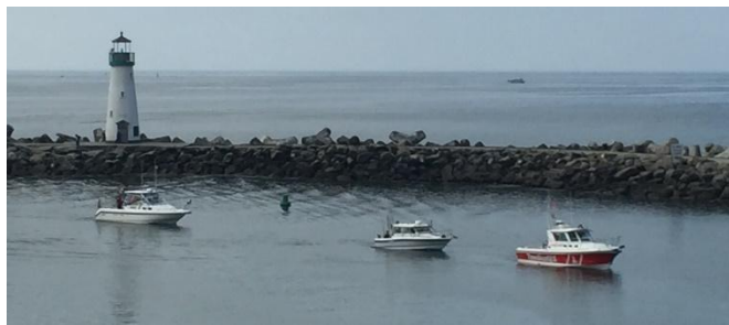
Facility 301219 assisting Vessel Assist