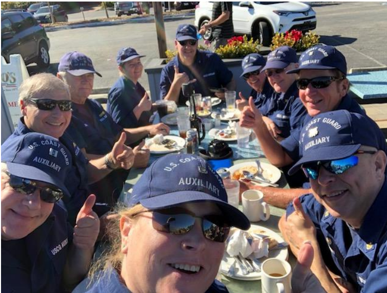
After a great morning of boat crew training, the crews of C.R.A.F.T. Moment and Mai Long enjoying lunch.