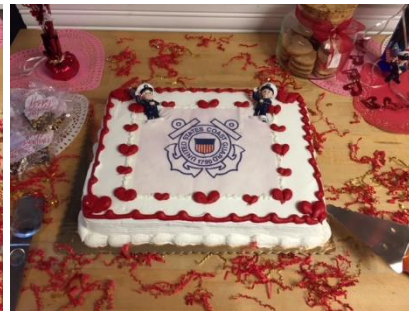
Cake 2- Vanilla