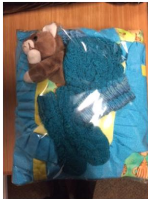
A Quilt Example