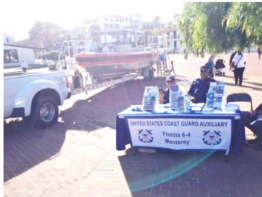
PA Booth and 29' RBS