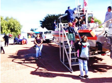
Locals touring the 29' RBS