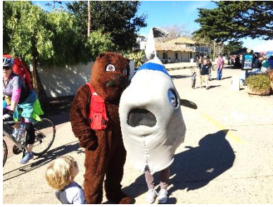
Last Year- Happy Together!