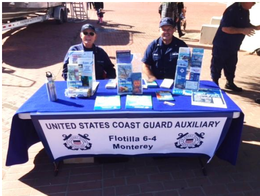
Our Public Affairs Booth