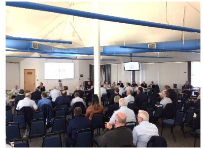
District Board and Staff Meeting