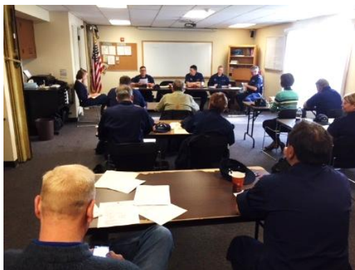
Division FC and Staff Officer's Meeting

11. Our first Division Meeting of the year was conducted on Saturday, January 27 th from 1000 hours until noon at the Coast Guard Monterey Station Classroom.