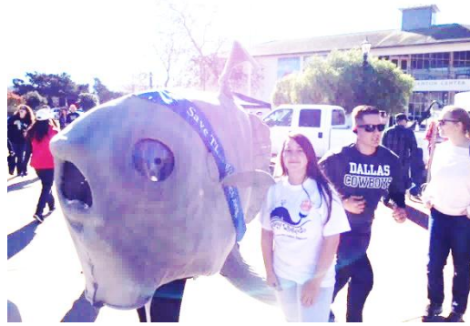
This year-the sad Monterey Sunfish.... notice the tear!