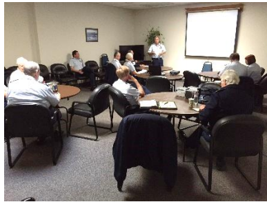
Division Cdr's Meeting