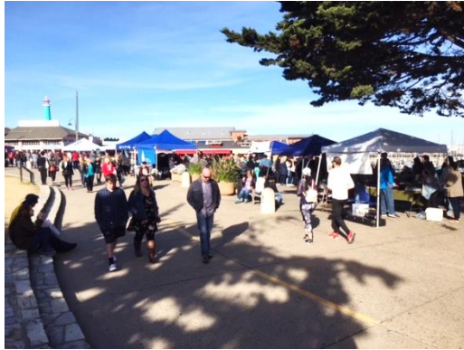
The busy Recreation Trail on which Whalefest was located