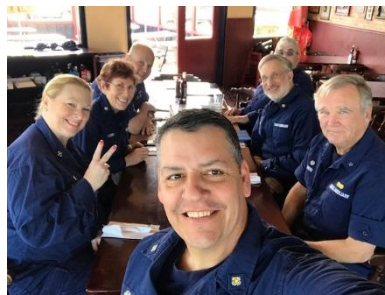
Fellowship Luncheon and Group Selfie!

Following the Luncheon, everyone went over to the Monterey Tourist Plaza to assist our other Division 6 Auxiliarists already present with Whalefest.