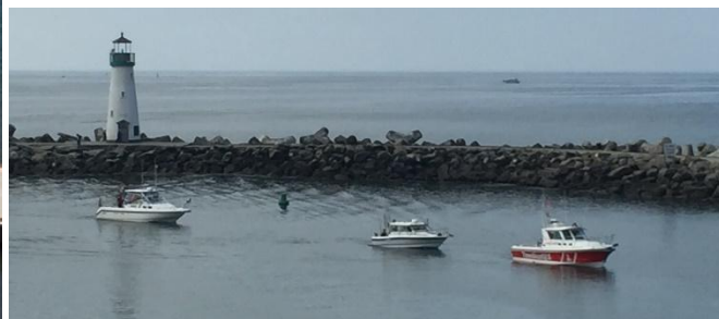
Facility 301219 assisting Vessel Assist