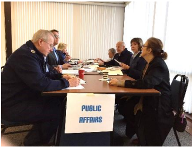
Public Affairs Class