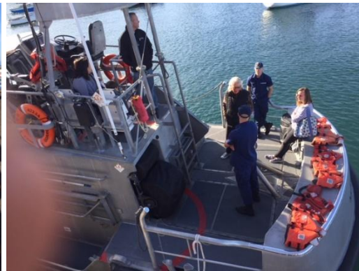
47-foot Motor Life Boat ready for tours Just a few of many visitors on board!

Coastie was highlighted in the Monterey County Weekly's Advertisement for Whalefest!